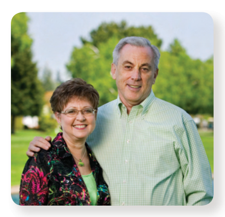
It all started a few years ago with one small gift. After making that first donation, they were hooked. Learn more about these valued Partners by turning to page 4.