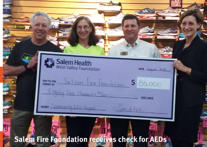
Salem Fire Foundation receives check for AEDs